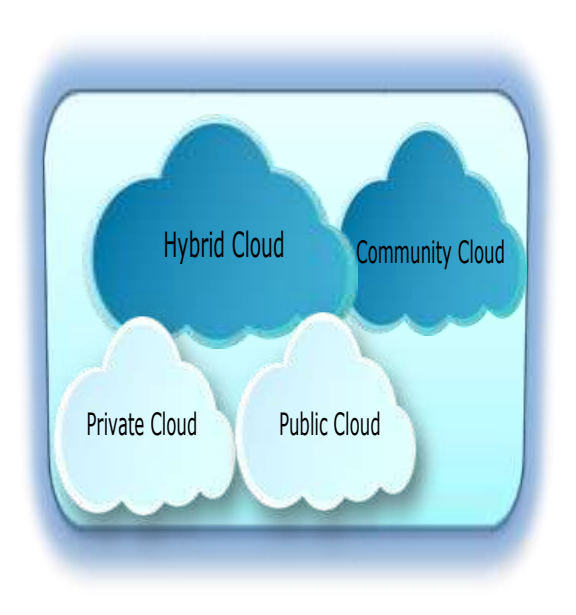
Figure 2: Cloud Deployment Models