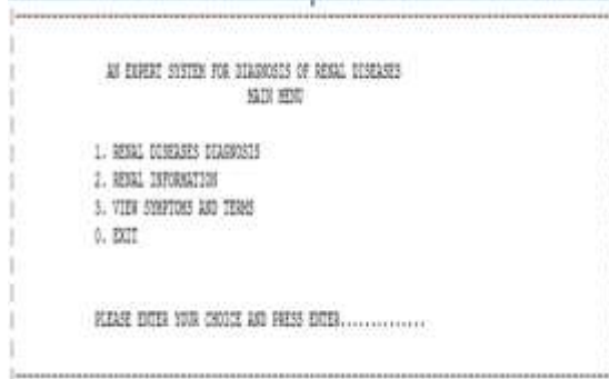
Fig. 2: Menu of an Expert System for Kidney Diagnosis

The initial rule to be executed should be main menu that display below screen. As illustrated in Figure 2