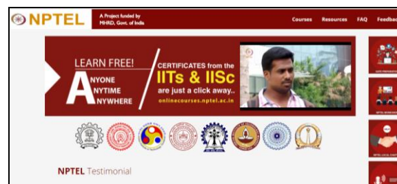
Fig.1 Home Page of NPTEL online courses.

NPTEL stands for National Programme on Technology Enhanced Learning. It is a project funded by MHRD, initiated in 2003. It is a joint initiative of seven Indian Institute of Technology (IITs) and Indian Institute of Science (IISc) for offering courses on engineering and science, initially. Now, NPTEL has started online course in computer science; electrical, mechanical, and ocean engineering; management; humanities, music etc. It offers free course with nominal fees for certification. Anybody from anywhere can join their course. NPTEL portal offering courses is shown in fig. 1.