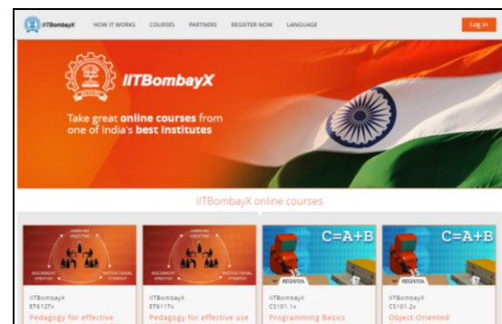
Fig. 3. Home Page of IIT BombayX.

IITBombayX is a non-profit MOOC platform developed by IIT Bombay using the open-source platform Open edX, in 2014. It was created with funding from National Mission on Education through Information and Communication Technology (NME-ICT), Ministry of Human Resource Development (MHRD), Government of India. Currently, it is offering 63 courses on different subjects from multiple disciplines. Some of the courses provided are as shown in Fig. 3.