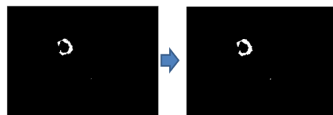
Fig. 4 Noise filtering output

The noise filter used is eroded and dilate to reduce the noise on the threshold image. The noise filtering results in Fig. 4 found that noise was reduced and the colour was smoother.