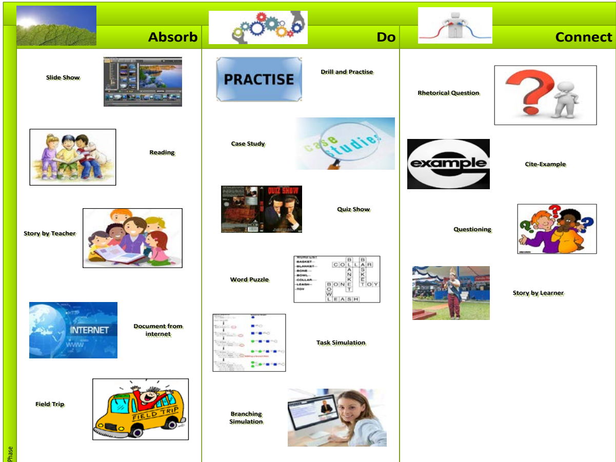
Figure 2. Absorb-Do-Connect Activities Design Presented

provide methods of implementing the materials already provided and Connect-type activities that apply the method for the learners to better understand the given material. All of these things in we see in the following picture.