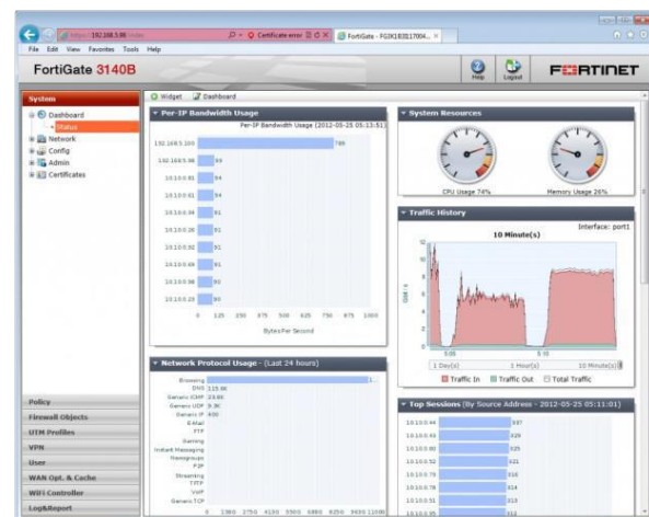
Fig.2: FORTINET - Example of UTM

Our solution Security Policy Monitoring System (SPMS) to this problem consists of three steps: