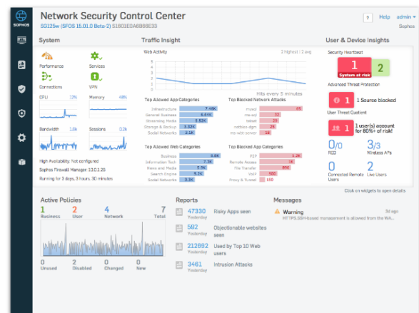
Fig.1: SOPHOS - Example of UTM

The security tools that currently exist are performing and respond well to the needs, but the problem is how to use these tools? How to minimize the human factor? For example, if the administrator forgets to shut down a vulnerable service, or leaves a critical folder with type 777 permission, how do you resolve these problems?