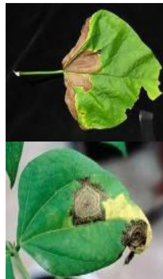
Fig.1 Affected Leaves with various Diseases

The classification accuracy is achieved with the help of HSI transformation , it is applied to the input image, and then it is segmented using Fuzzy C-mean algorithm. Feature extraction stage deals with the color, size and shape of the spot and finally classification is done using neural networks.