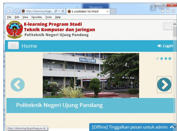
Fig. 2 Moodle as LMS Platform

Considering its many advantages and requirements from faculty members, a new initiative to apply LMS was started in our institution in 2007. Moodle was chosen considering its wide user and active community in the world as well as in Indonesia .