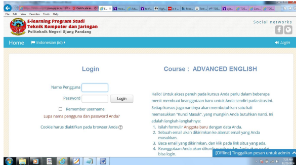
Fig. 3 Course setup on Moodle platform

In order to apply blended learning, English course lecturer required to set up the course on Moodle first. It is exemplified in the following figure.