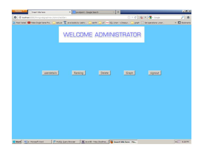
FIGURE2: Welcome Administrator.

Administrator has a set of privileges to modify or update website based on user details.