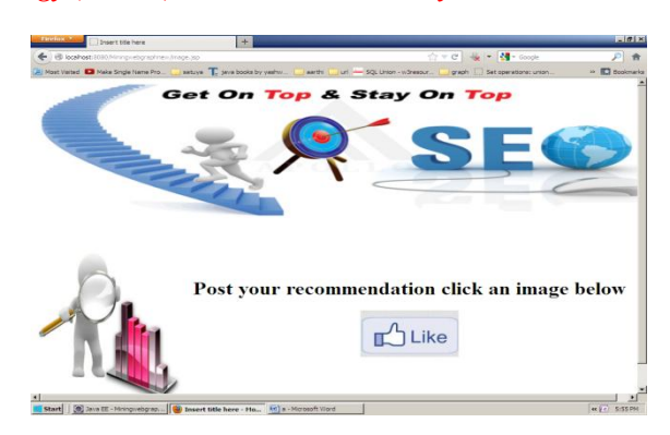
FIGURE3: Recommendation post on User like's.

User post his likes of interested job list based on his professional, salary, expectations etc. This helps to know the necessity of user for particular search.