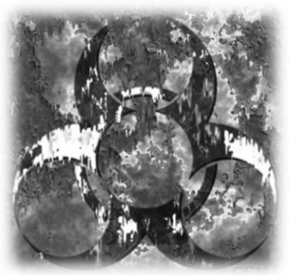
Fig 2 Cryptovirus

instance, a virus or worm may generate and use its own Key pair at run-time [5]. Crypto viruses may utilize secret sharing to hide information and may communicate by reading posts from public bulletin boards. Crypto Trojans and crypto worms are the