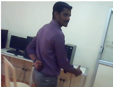
Reference Image Frame (b)