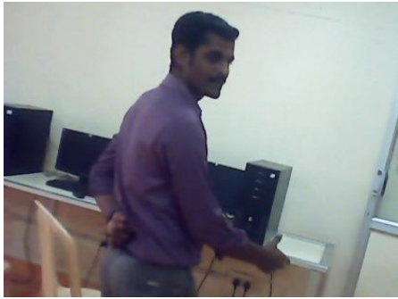
Input image Frame (a)