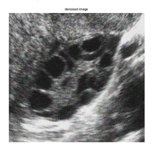
Fig. 3 Denoised image

Here, A(i,j) is the noisy image of size r \times c , where 'r' is the number of rows and 'c' is the number of columns. B(i,j) is the denoised image.