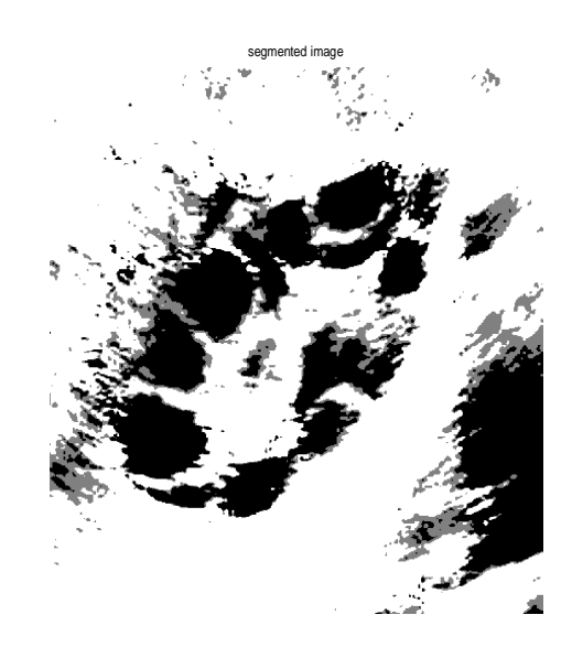
Fig. 5 Segmented image