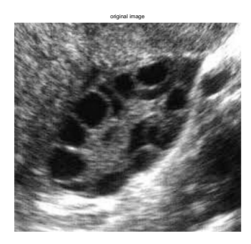
Fig. 2 Original Ultrasonic image (Input)