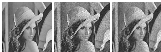
(a) Input image leena (b) Noisy image \sigma = 0.02 (c) Homomorphic (M.F) Denoised

In the above case of median filter when we added the speckle noise of s.d 0.02 then it becomes the second (b) noisy image then we will apply the median filter on it then it denoised the noisy image and gives the image unclear and least blurred. It gives the 26.4253 PSNR