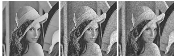
(a) Input leena image (b) Noisy image \sigma = 0.02 (c) Median filter (Denoised)

In the above case of median filter when we added the speckle noise of s.d 0.02 then it becomes the second (b) noisy image then we will apply the median filter on it then it denoised the noisy image and gives the better result or gives the image clear and least blurred. It gives the 26.4037 PSNR values it shows that how much image is denoised..