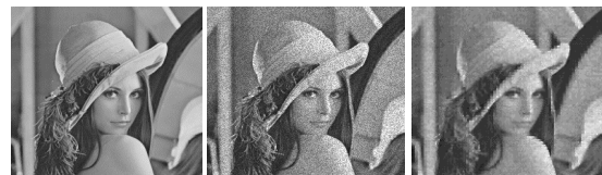
(a) Input image leena (b) Noisy image \sigma = 0.02 (c) DWT+Wiener filter (Denoised)

In the above case of homomorphic wiener filter when we added the speckle noise of s.d 0.02 then it becomes the second (b) noisy image then we will apply the homomorphic wiener filter on it then it denoised the noisy image and gives the image unclear and least blurred. It gives the 28.2672 PSNR values. E.(DB1 FAMILY) Image results for DWT+Wiener filter using window [3 3]