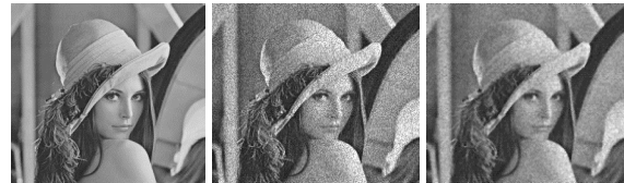
(a) Input noisy image leena (b) Noisy image \sigma = 0.02 (c) Homomorphic (W.F) Denoised. Fig (5.4.1.1)

In the above case of homomorphic wiener filter when we added the speckle noise of s.d 0.02 then it becomes the second (b) noisy image then we will apply the homomorphic wiener filter on it then it denoised the noisy image and gives the image unclear and least blurred. It gives the 28.2672 PSNR values. E.(DB1 FAMILY) Image results for DWT+Wiener filter using window [3 3]