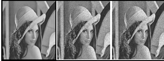
(a) Input image leena (b) Noisy image \sigma = 0.02 (c) Weiner filter (Denoised)

These are the following results for when we use the wiener filter for denoising the image