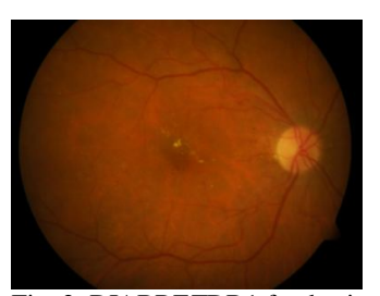
Fig. 2. DIABRETDB1 fundus image

of 89 colour fundus images where 84 of them contains mild non proliferative signs of diabetic retinopathy whereas 5 are normal images which do not contain any signs of diabetic retinopathy [25]. The abnormalities present in the images are relatively small since they appear near the macula they are considered to threaten the eyesight. Fig. 2 indicates the dataset image.